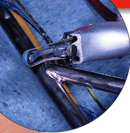
Blending a weld using a portable file belt.