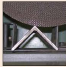
Correct (Two small contact points)

Use an oscillating head when cutting thicker cross sections (over 3"). This reduces arc of contact and permits larger sections to be cut with a given diameter wheel.