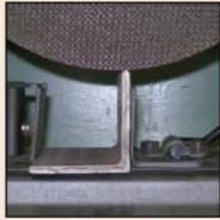
Incorrect (Wide contact point)

Fixture the work-piece to minimize wheel contact area for a faster, cooler cut.