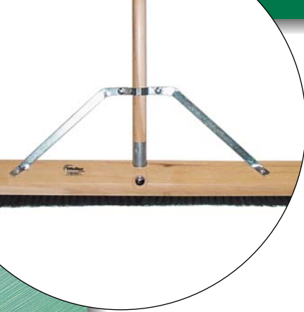
← Heavy-duty steel brace (Item #44290) provides extra support.