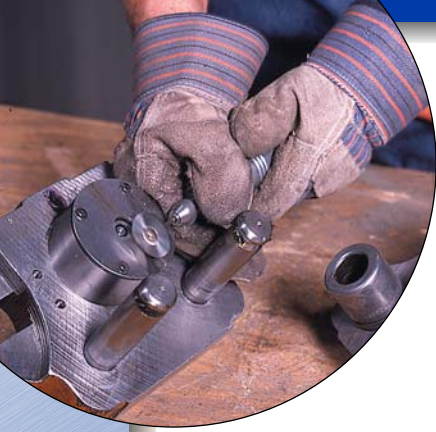
Removing galled spots from a metal forming die.