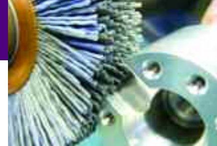
Deburring the edges of a machined aluminum component.

Weiler's Application Engineering Team is available to recommend the best product and process to meet your specific application requirements.